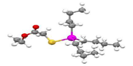
Fig. 3: Geometry optimized structure of complex 3